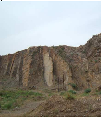
(3) Cliff (Sohna Hills)