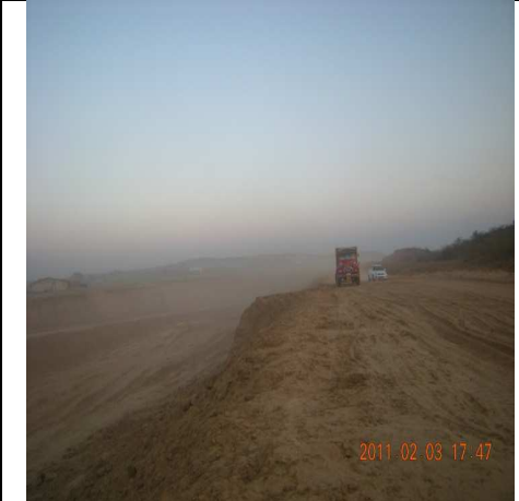
(2) Near KMP Highway (Under construction)