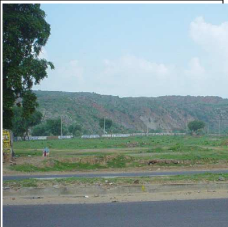
(4) Cliff (Sohna Hills)