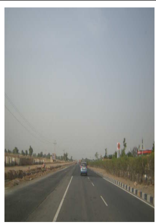
(1) View at NH8 towards Delhi