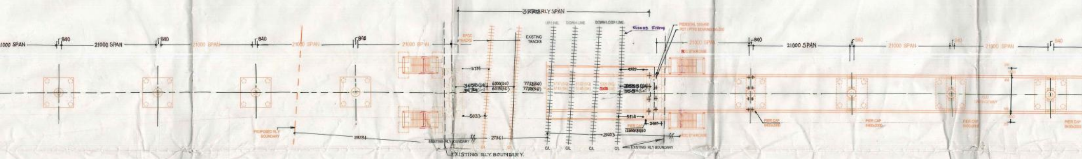
PLAN OF PROPOSED ROB

NDI CONTD:- ND/METHODOLOGY CONSTRUCTION ACTIVITIES, TIONS AND MEASURES TO BE OBSERVED DURING OF ROB SHOULD BE ACCORDANCE OF BOARD'S /CE-I/ BR/158/3 (POLICY) PT II DATED 16-07-2008 STEEL GIRDER WILL LAUNCHED FIRST AND THEN BE WILL BE CASTED IN SITU AFTER PROVIDING GEMENT. RICATING OF GIRDERS & DECK SLAB WILL BE ER SPEED RESTRICTION OF 30 KMPH.